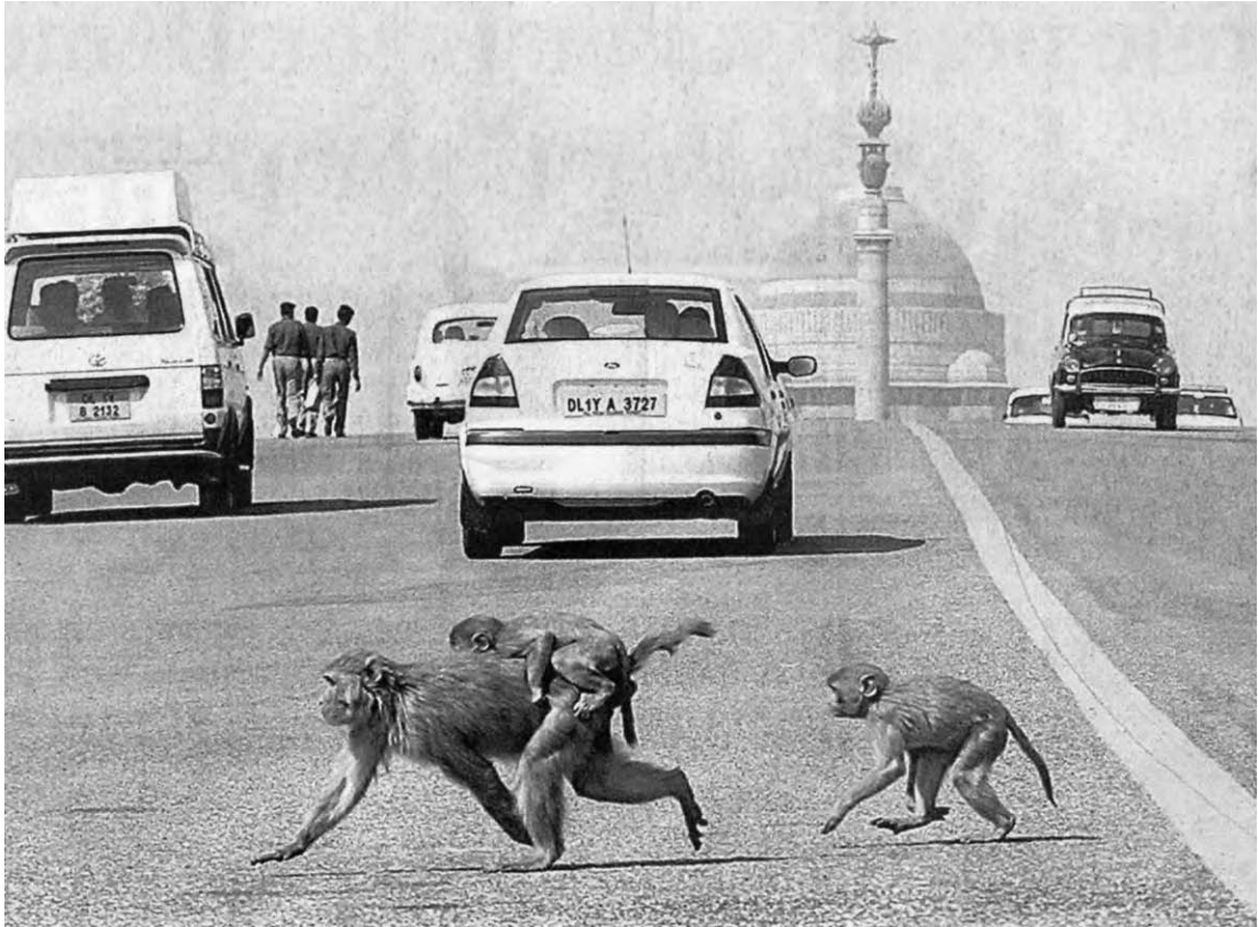
Monkeys cross the road outside the presidential palace in Delhi.