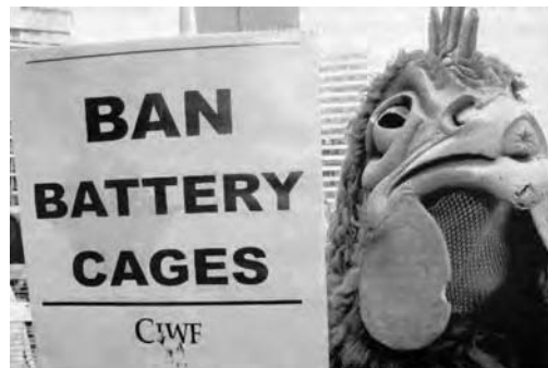
An animal rights activist protests European Union farm policy in Brussels.