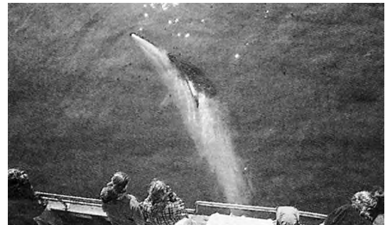
In demand: tourists watch a minke whale in Iceland where scientists have the go-ahead to kill 38 of the animals for research