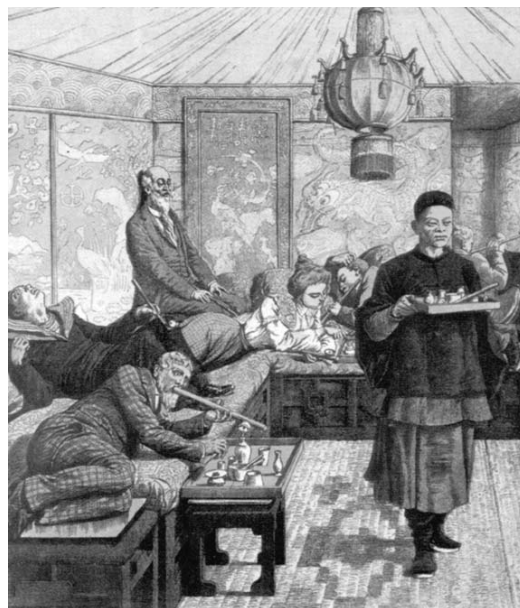
Le Petit Journal (1903), reproduced in Opium

3 50 My contempt for books such as this arises precisely because they are so effective. After a couple of hours reading it, I was on the point of overlooking my years of suffering, harm and struggle and almost booking a one-way ticket to the 55 Laotian jungle, there to reside on a teak bed surrounded by jasmine flowers. It is these dreamy