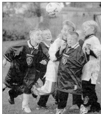
Can soccer-obsession lead to numeracy?