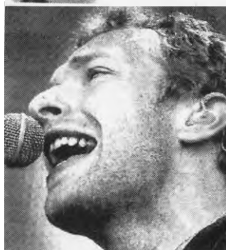
Alessandro Moreschi (top), was the last known castrato, whose emotional impact has been likened to pop singers such as Chris Martin of Coldplay (bottom)