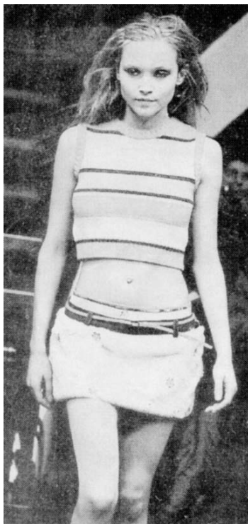
The Lolita look from Dolce & Gabbana

13 There is an argument that the reason only adults are shocked by these things is that kids have an elaborate but complicated relationship with truth and